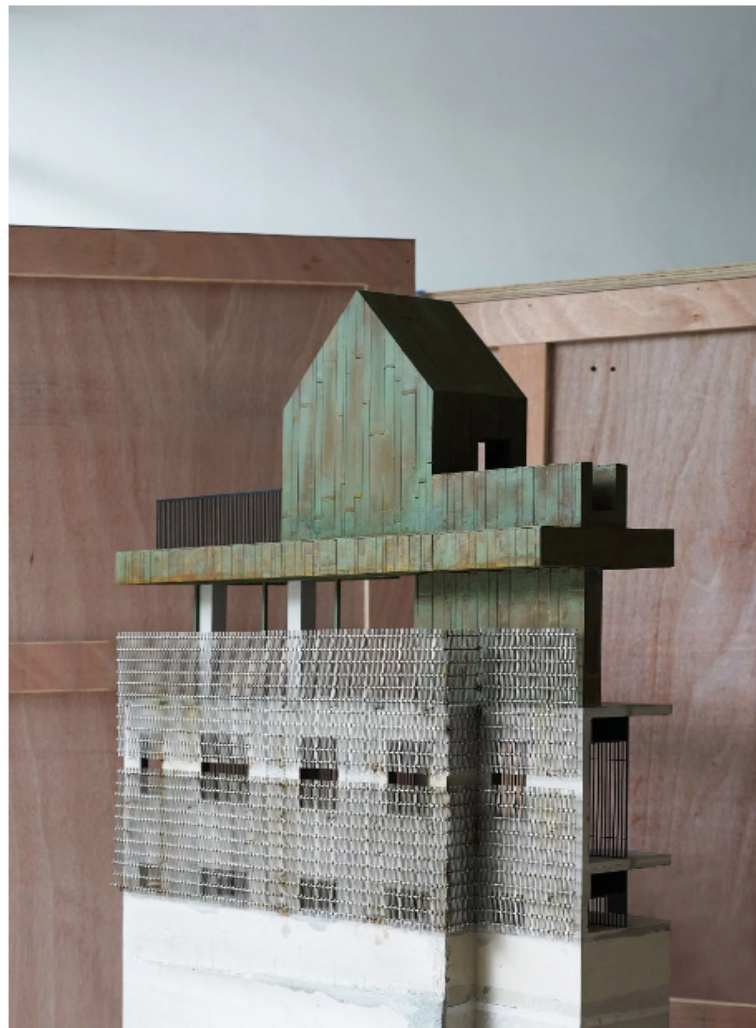
A fragment model of Neri&Hu’s Nantou City Guesthouse project at the 18th Venice Biennale of Architecture.

The village is undergoing regeneration and Neri&Hu was hired to transform one of its walk-up tenement buildings.