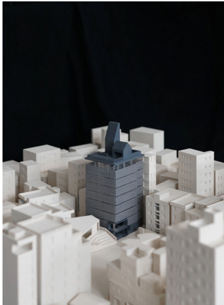
A model of Neri&Hu’s Nantou City Guesthouse project at the 18th Venice Biennale of Architecture.

“People visit, and it might be a little rough, it might not be what they imagined a five-star hotel would be, but they like it – even if they aren’t able to articulate why,” Neri says. “It’s a representation of what Shanghai is.”