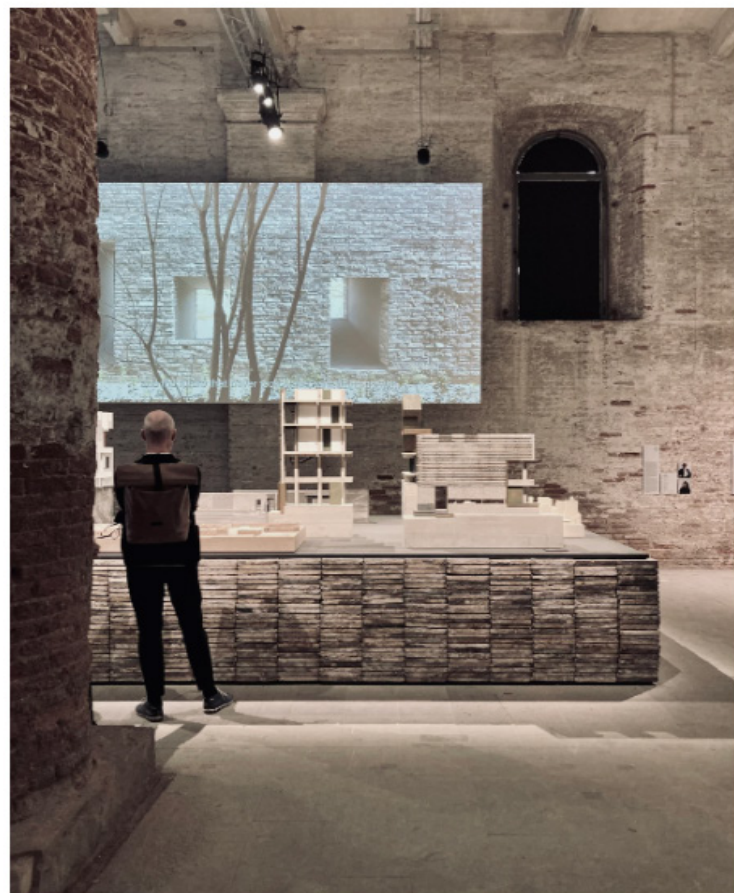
The Neri&Hu installation at the 18th Venice Biennale of Architecture features three models of their adaptive reuse projects sitting on top of a podium made of old Venetian roof tiles.

“There’s no such thing as tabula rasa [a clean slate]” even though raze and rebuild is the default mode of development in much of Asia, Neri says.